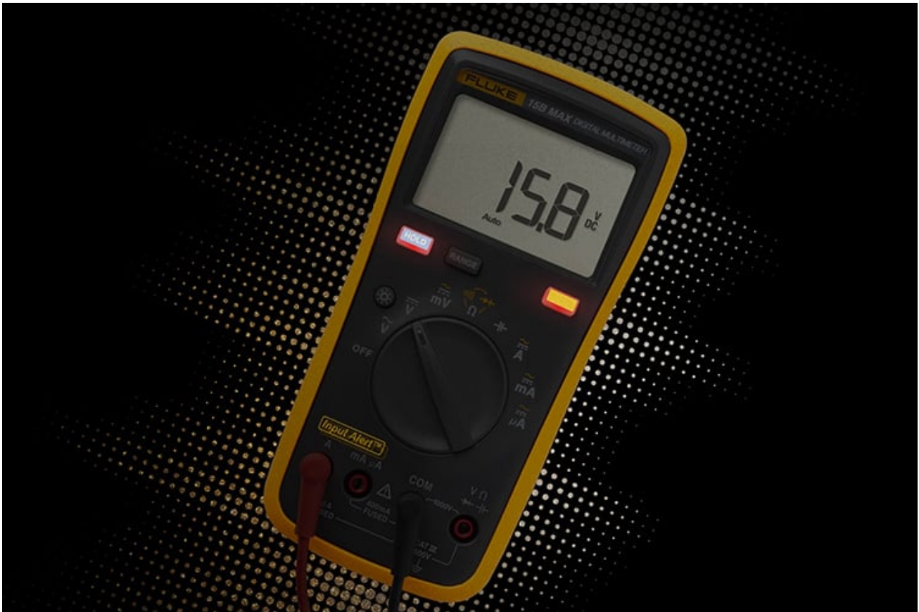
Audible and visual alarm for incorrect connections